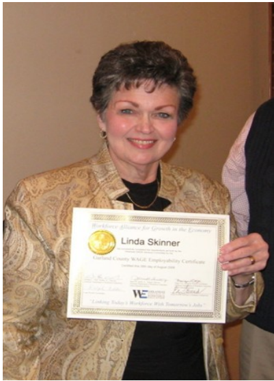
"Linking Today's Workforce with Tomorrow's Jobs"